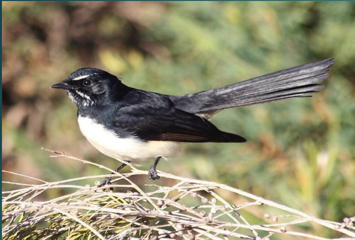
Willie Wagtail (Rhipidura leucophrys)