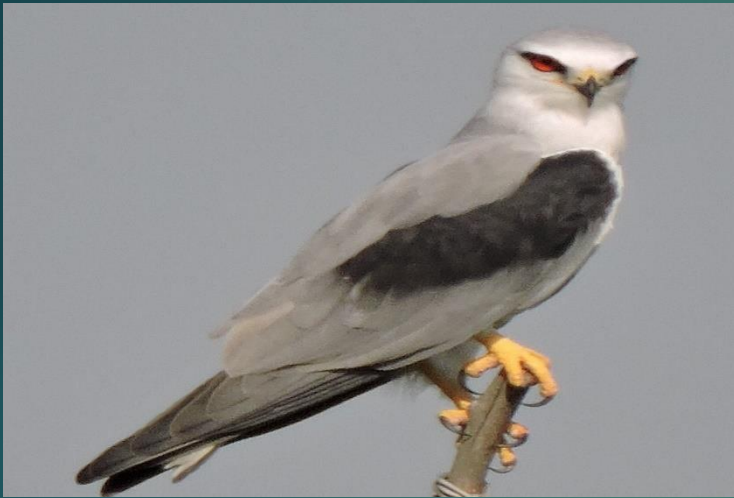
Black-shouldered Kite ( Elanus notatus )