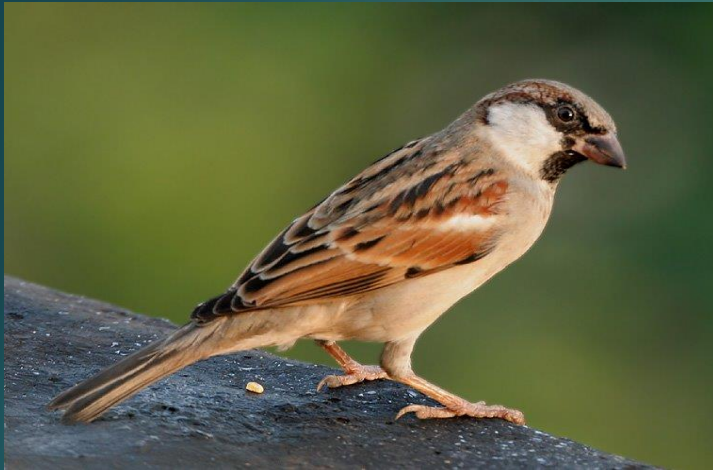
House Sparrow ( Passer domesticus )