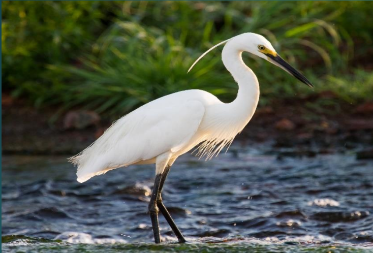
Little Egret ( Egretta garzetta )