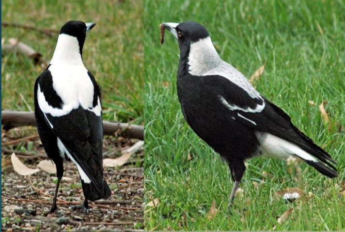
White-backed Magpie ( Gymnorhina hypoleuca )