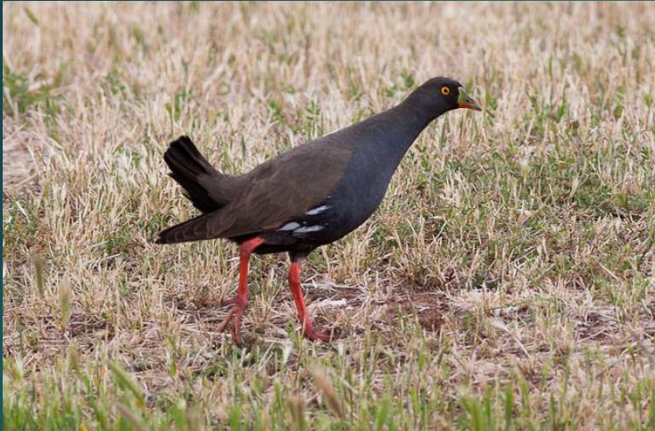
Black-tailed Native Hen ( Tribonyx ventralis )