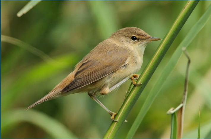
Reed-Warbler ( Acrocephalus australis )