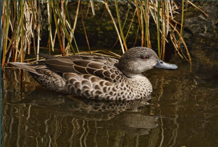
Grey Teal ( Anas gibberifrons )