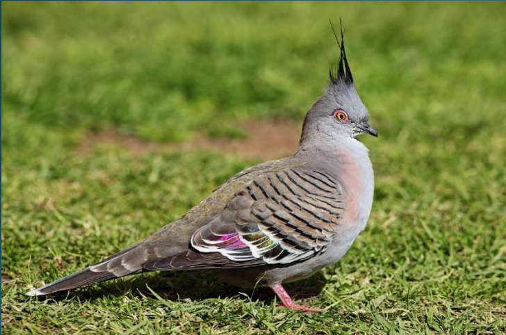
Crested Pidgeon ( Ocyphaps lophotes )