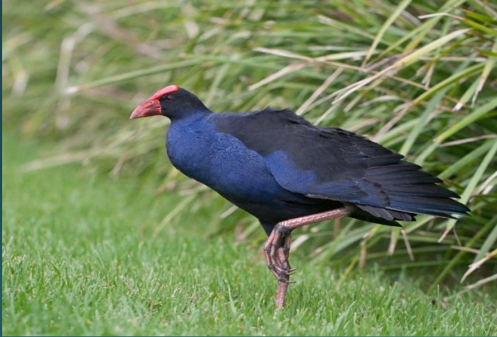
Western Swamphen ( Porphyrio porphyrio )