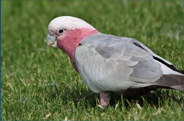
Galah ( Eolophus roseicapillus )