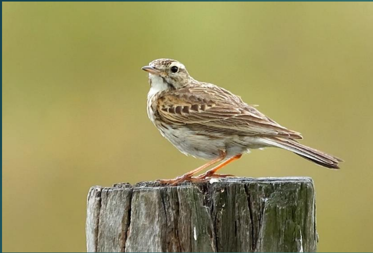
Australian Pipit ( Anthus novaeseelandiae )