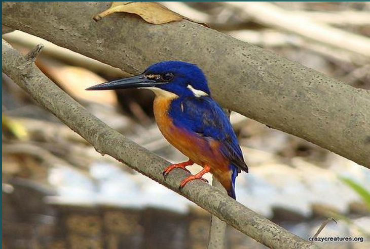
Azure Kingfisher ( Alcyon azurea )