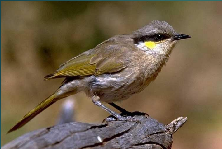
Singing Honeyeater ( Meliphaga virescens )