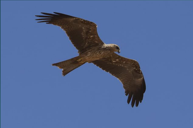
Black Kite ( Milvus migrans )