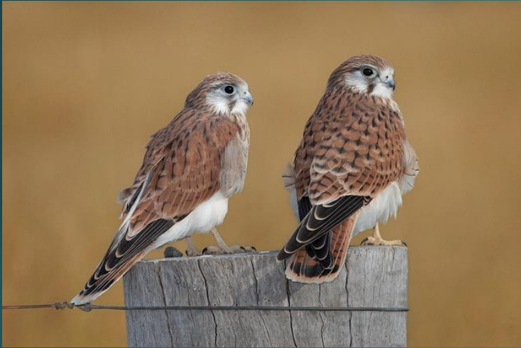
Nankeen Kestrel ( Falco cenchroides )