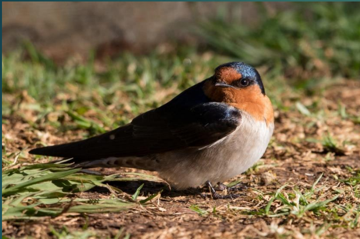
Welcome Swallow ( Hirundo neoxena )