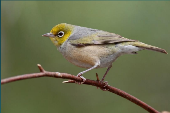
Grey-breasted Silvereye ( Zosterops lateralis )