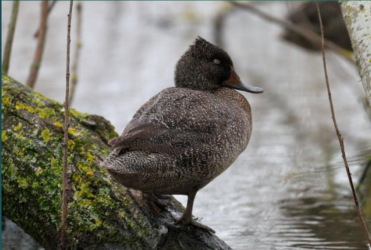
Freckled Duck ( Stictonetta naevosa )