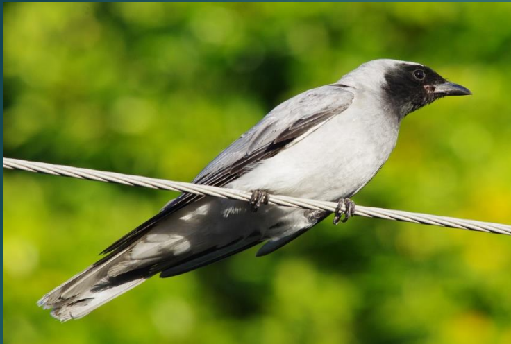
Black-faced Cuckoo-shrike ( Coracina novaehollandiae )