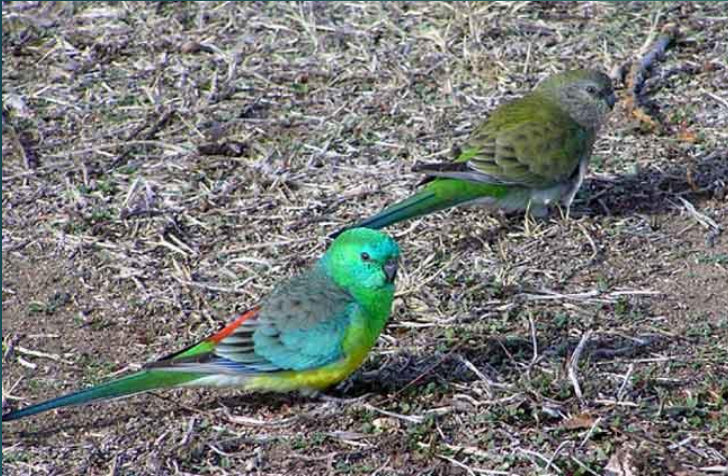
Red-rumped Parrot ( Psephotus haematonotus )